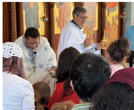
Prayer of Blessing for the Church School Staff and Students upon the new Church School year