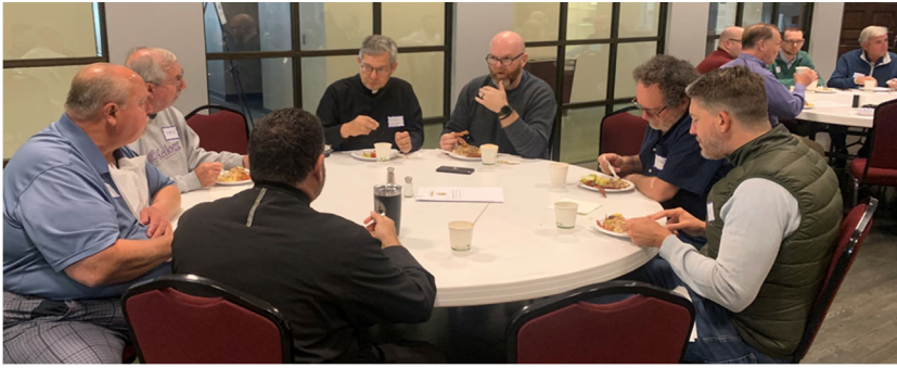
The men enjoy a hearty breakfast together