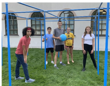
Teen SOYO Teen Night Kick-Off