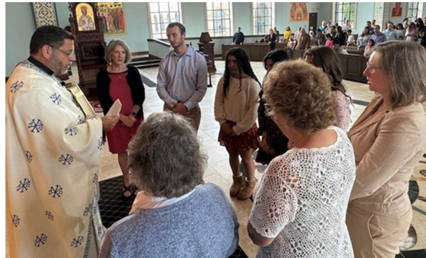
Blessing of officers of the Women of St. Nicholas and Teen SOYO for the upcoming year